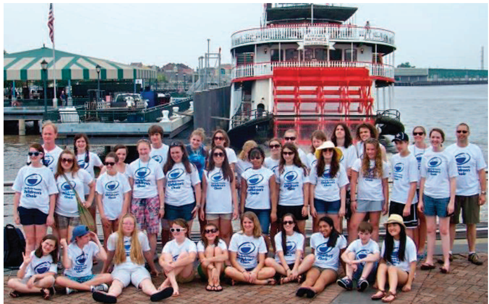
The FCCC Chamber Singers by the Mississippi River in New Orleans during their summer tour in June, 2009. Later that evening we enjoyed a dinner cruise on board the Steamer Natchez, in the background.