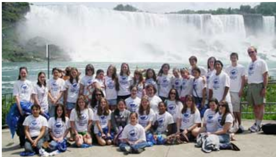
The FCCC Chamber Singers gather in front of the American (Bridal) Falls in Niagara Falls, Canada just after riding the Maid of the Mist .