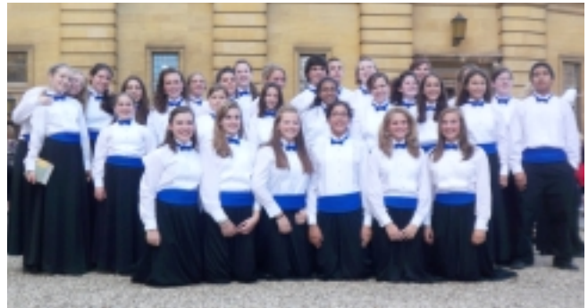
The choir performed at the Sheldonian Theatre in Oxford, England.

"I cannot thank you enough for providing such an amazing experience for [my daughter] and the entire choir. She was so excited and experienced so many positive things. I can't think of a better way for her to grow and see the world than through music. It was definitely one of those life changing experiences for her and I am thrilled. The time and energy you give is greatly appreciated. She will be a better person because of FCCC."