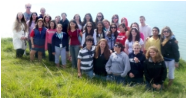
The FCCC visited the White Cliffs of Dover with the English Channel in the background. Although not visible in the photo, the weather was clear enough to see France across the Channel.