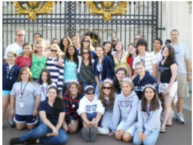
The FCCC visited Buckingham Palace in London.

From the Music Director continued from page 1 elements so that we may then enjoy bringing the music alive for our audiences and ourselves. As I said, this is endlessly challenging!