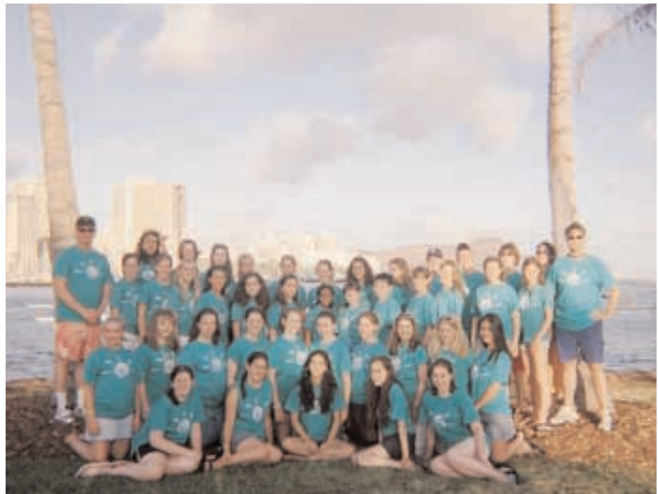
The FCCC Chamber Singers in Hawaii

The 2005 - 2006 Season is shaping up to be fantastic as well. On November 1 our Chamber Singers and Concert Choir members will have a once in a lifetime experience - performing at Carnegie Hall! The FCCC has performed on the main stage (Stern Auditorium) in 1997 and in Weill Recital Hall in 2001 (three weeks after September 11). This will be the first experience in Stern Auditorium for our present members. ( See inside. )