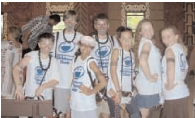
Our fearsome Maori warriors

The final two days of the festival gave us lots of time for touring the island, including a very moving visit to Pearl Harbor, and some free time at the beach near Waikiki. The photo on page one includes most of our group and was taken just before sunset in Honolulu. Yes, that is Diamond Head in the background! Our choristers represented Connecticut very well and the choir was invited back to a festival in the future, probably in 2012 or 2013! Aloha!!