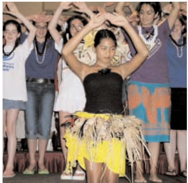
A group Hula lesson